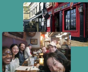
Doing trivia at the Queen Vic!