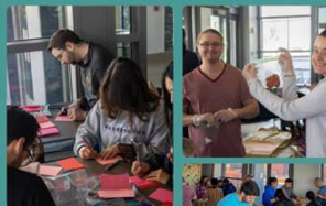
Writing Valentine's cards for Friendship Place